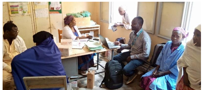
Formative supervisory at the Integrated Health Centre of Missirata, Agadez region. UNICEF continues to ensure health care for vulnerable populations.