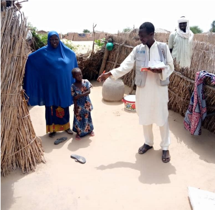
Monitoring of sanitation at the department level in Gueskerou, Diffa Region. UNICEF supports the Community-Led Total Sanitation (CLTS).

and Maine Soroa for the promotion of social cohesion, a total of 80 networks have been established in 90 villages/neighborhoods, and their capacities have been strengthened on the theme.