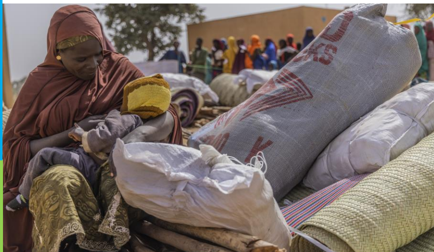
UNICEF assisted population affected by the crisis in Tahoua region. UNICEF is committed to provide life-saving activities for women and children in needs.