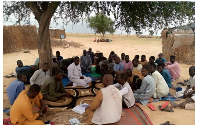
Village assembly, promoted by Unicef for sanitation monitoring in the Gueskerou Commune, Diffa Region. UNICEF provides support to communities to end Open Defecation. @Kassoka, 2023.